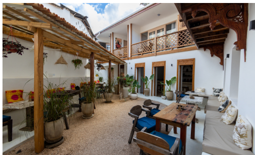
THE DOOR BISTROT COURTYARD & DINING AREA