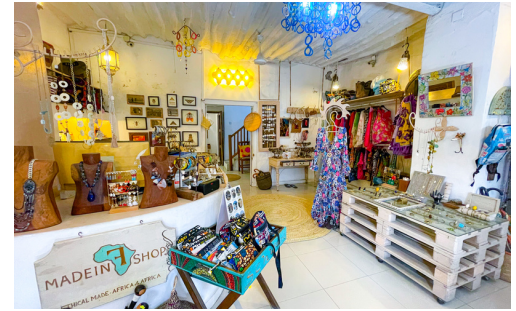
THE WONDERS BOUTIQUE CONCEPT STORE

TO/ AGENTS: RESERVATIONS@SHARAZABOUTIQUEHOTEL.COM