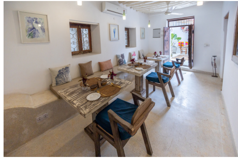
THE DOOR BISTROT INDOOR DINING AREA & COWORKING SPACE